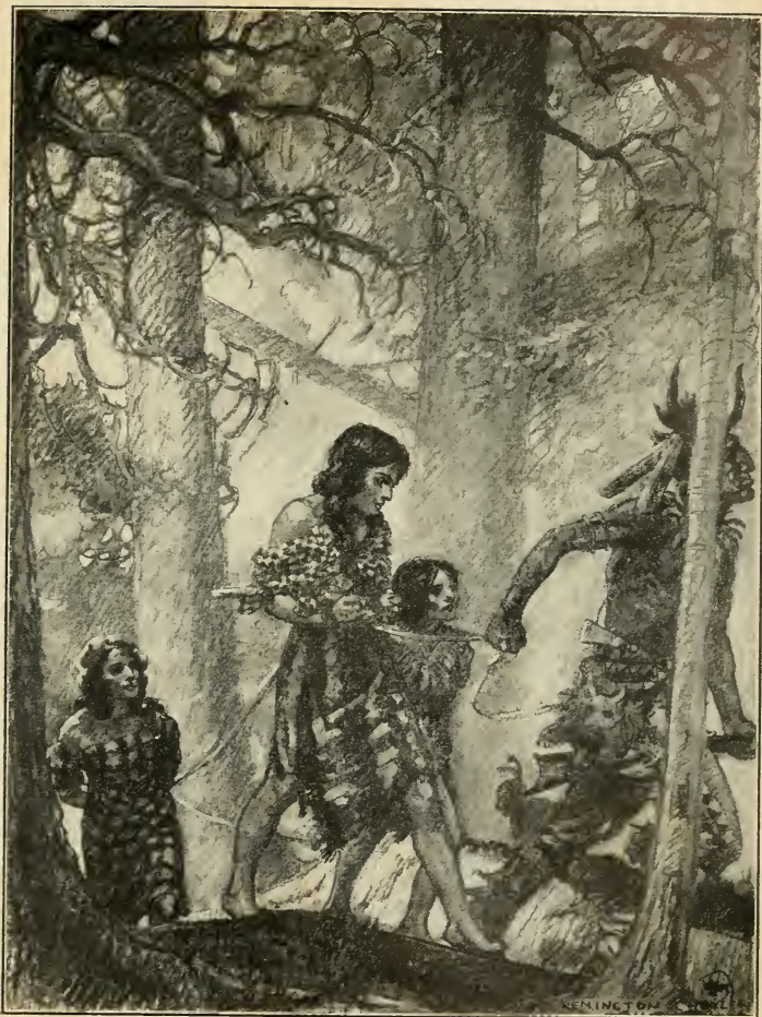
He was out to kill in his madness; yet he refused to permit the torture of prisoners